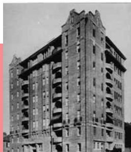
Kingsclere , 1912

Kingsclere , completed in 1912 and designed by Halligan and Wilton, was the first block of high-rise apartments built on this street and among the first in Sydney. They aimed at an exclusive market, with features such as two balconies and two bathrooms for each flat, luxurious wood panelling and automatic passenger lifts. In the 1920s and 1930s, Macleay Street became known for its fine apartment buildings designed by prominent architects, including the Macleay Regis at No. 12 (1939), Manar at No. 42 (1926) and Byron Hall at No. 97–99 (1929).