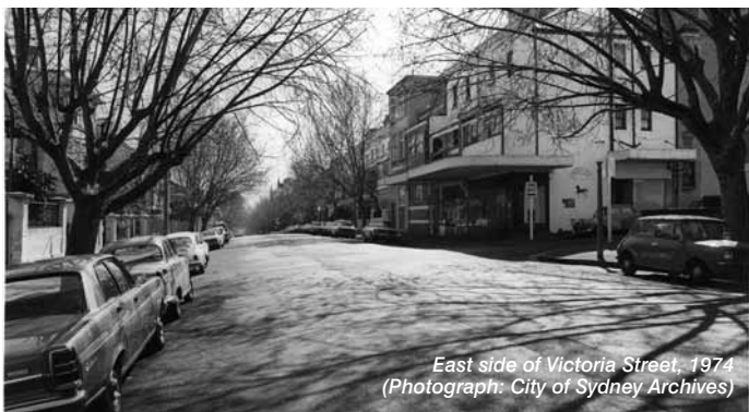
East side of Victoria Street, 1974

Walk on down the street until you arrive at No. 202 on the left hand side, formerly the house of Juanita Nielsen (20).