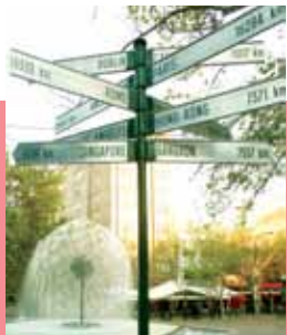
El Alamein Fountain

This was the site of Maramanah , the house occupied by eccentric aunts in Robin Eakin's book Aunts up the Cross (1965). The aunts had their own private orchestra and could see no good reason to pay taxes or conform to any of the usual behaviour expected of "respectable" society. The house was sold to the City Council in 1945 and demolished to build the park. The El Alamein Fountain, designed by Robert Woodward, was built in 1961. The dandelion effect of the arrangement of its bronze pipes has become a symbol of Kings Cross.