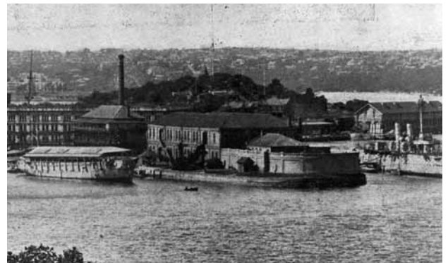
Garden Island when it was still an island, c1920

If you continue north along Macleay Street and Wylde Street you will reach the Royal Australian Navy base, HMAS Kuttabul, incorporating Garden Island. There has been a naval base on Garden Island since 1858. This picture shows it c1920. It was joined to the mainland by the building of the Captain Cook Graving Dock in 1942. Many of the old colonial villas of the area are now part of HMAS Kuttabul. For more information on guided tours call the Naval Historical Society on 9359 2372.