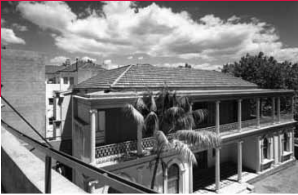
Tusculum