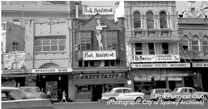
Pink Pussycat Club

Continue along Darlinghurst Road to the end. To the left is Macleay Street and opposite are the Fitzroy Gardens (02).