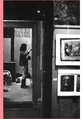
Painter at work at the Yellow House, early 1970s