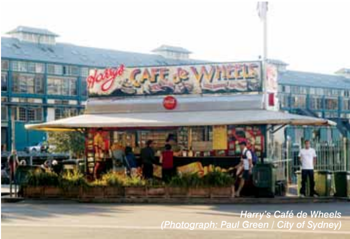
Harry's Café de Wheels

The 'Loo is one of Australia's most internationally famous place names, mentioned not only in the Monty Python 'Bruces' sketch, but in F Scott Fitzgerald's Tender is the Night , perhaps because this was many visitors' first landfall in Australia – and the name couldn't be more Australian. The name is derived from the local Aboriginal language, variously spelt as Walamul, Wooloo Mooloo and Wallamoula . The navy still ties up here (15), but the " Finger Wharf " (16), one of the largest in the world, has now been turned into residential units, hotel accommodation and restaurants. Also in the area are several pubs and the legendary pie cart, Harry's Café de Wheels , Cowper Wharf Road (17).