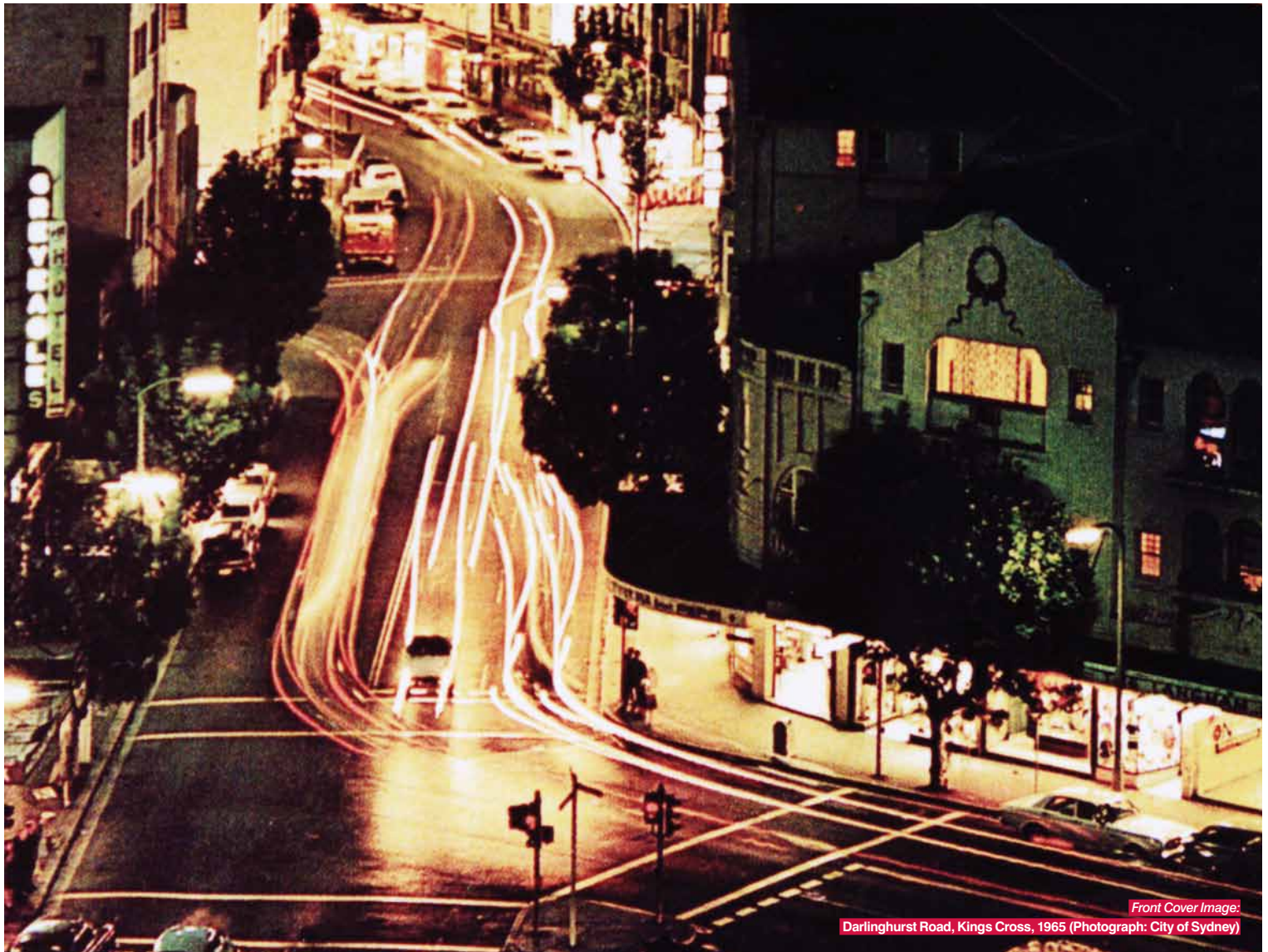
Front Cover Image: Darlinghurst Road, Kings Cross, 1965