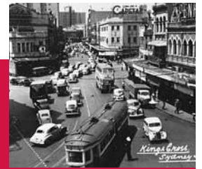
Kings Cross, c1950

The intersection of many streets, including the crossover of Darlinghurst Road and Victoria Street at William Street, was originally named Queens Cross to celebrate the diamond jubilee of Queen Victoria in 1897. In 1905 the name was officially changed to Kings Cross. William Street then was much narrower than it is today. It was widened in 1916, and the building of the Kings Cross tunnel in the 1970s extended it through to Bayswater Road. The buildings at the top of the Cross have sprouted bright advertising signs for many decades, and the current large Coca-Cola sign has become a Kings Cross landmark.