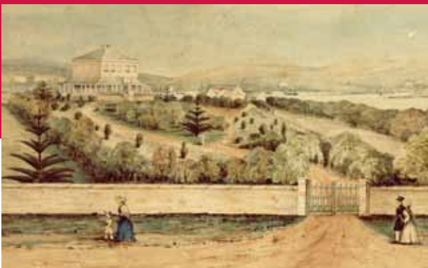
Rockwall, c1840

This is one of the remaining original grand residences of Potts Point. Its gardens once extended to Macleay Street. It was designed by John Verge and built 1830–37 as an “Italian villa” for John Busby, who achieved fame by overseeing the construction of Busby's Bore, a tunnel that brought fresh water into the city when the original Tank Stream was running dry. Italianate verandas were added later, and over its life the house has been many things, including a school for girls. By the 1960s it was virtually derelict, but was restored in the 1990s for the adjoining hotel (now Rockwall Apartments). Today, it is back in private hands.