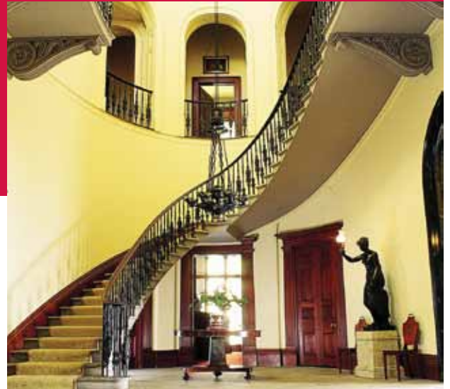
Staircase at Elizabeth Bay House