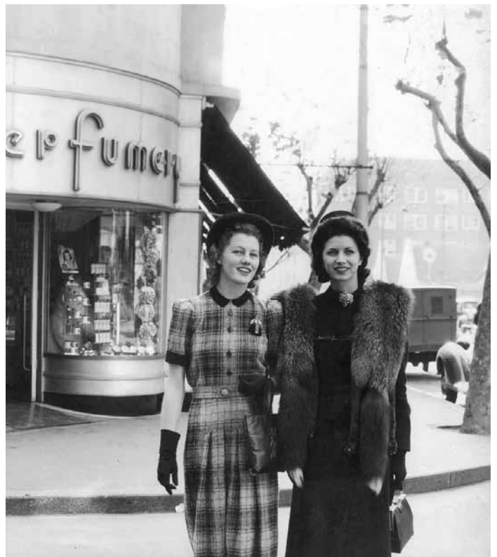
Two women outside Minerva French Perfumery in 1941

Retrace your steps along Orwell Street, turn left into Macleay Street, then left into Hughes Street, home of the Wayside Chapel (04), 29 Hughes Street.