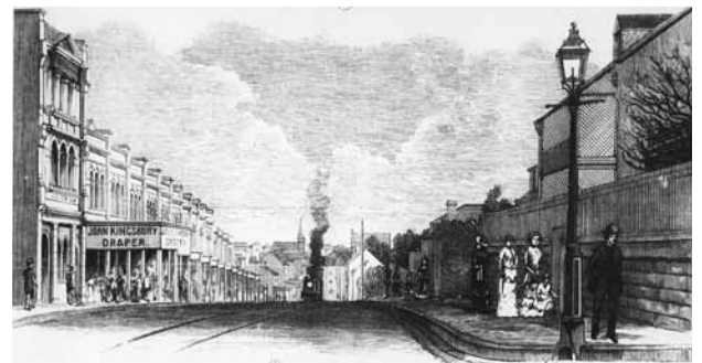
Glebe Point Road, 19th century (Lithograph: City of Sydney)

Continue up Glebe Point Road. On your right is Bidura (14) , 357 Glebe Point Road.