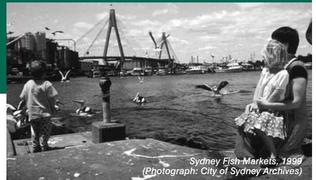
Sydney Fish Markets, 1999

In 1966, the Sydney Fish Market was relocated from Haymarket to this site. There was major reconstruction and expansion in the 1980s, with the former John Fairfax Limited bulk paper store becoming the location of a computerised auction room. The Fish Market today is open to the public and incorporates a working fishing port, wholesale fish market, fresh food retail market, food and beverage outlets and a seafood cooking school.