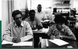
Students at Tranby in 1973

Tranby cottage was built in 1858 before the subdivision of the Toxteth Estate. Since 1958 it has been the home of the Tranby Aboriginal Cooperative College, the oldest independent adult Aboriginal education centre in Australia. With an average of 150 students, it seeks to provide self-determination for Aboriginal Australians. Courses include Applied Aboriginal Studies, Community Development, National Indigenous Legal Advocacy and Business Studies. The Co-operative has also developed affiliate organisations such as Blackbooks, the Aboriginal Development Unit and the Aboriginal Homeless Persons Hostel.