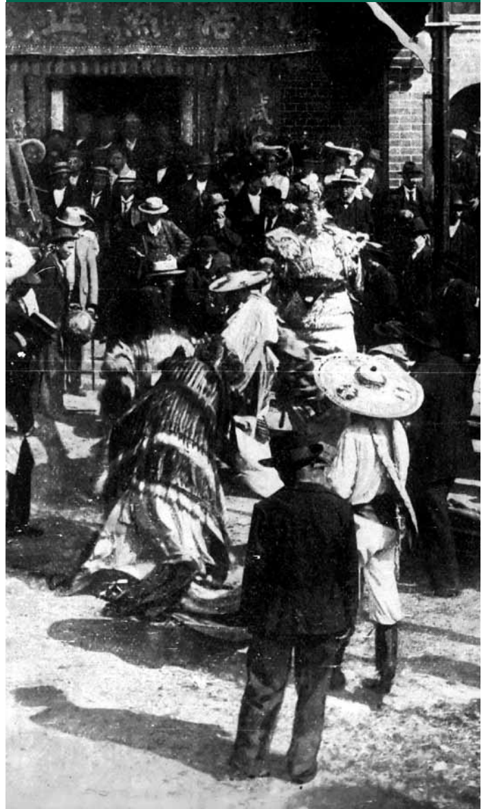
Sze Yup Temple in Edward Street, 1904

The Sze Yup Temple was built by immigrants from the area known as Sze Yup in the province of Guangdong, China. It is dedicated to Kwun Ti, a warrior and patriot in the era of the Three Kingdoms 220–265 AD, who was famous for his loyalty, physical prowess and masculinity. In Australia, immigrant Chinese worshipped him as a wise judge, a guide and a protector. There are only four temples of this type in Australia, and the Sze Yup temple is the most renowned. The central temple was built in 1898. Principles of Feng Shui are seen in its location on land that sloped from the temple to the waters of Rozelle Bay. In 1904 the central temple was flanked by two chapels, the Chapel of Departed Friends and the Chapel of Good Fortune.