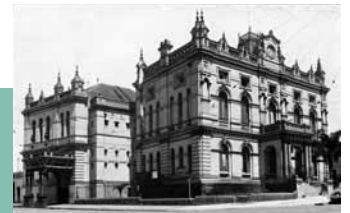
Glebe Town Hall, 1930s

The Italian-style Town Hall was built in stages from 1880 to 1891. It was designed by Ambrose Thornley Jnr, who was also responsible for Bellevue (18). Glebe was a separate municipality from 1859 until 1949, when the City of Sydney expanded to take over The Glebe and seven other suburban municipalities. In 1968, the City lost most of the areas it had acquired, and The Glebe became a part of Leichhardt Municipality. Glebe was returned to the City in 2003, and the former Town Hall is now a Council Neighbourhood Service Centre. Around the corner at 41 Lodge Street is the former Town Clerk's House.