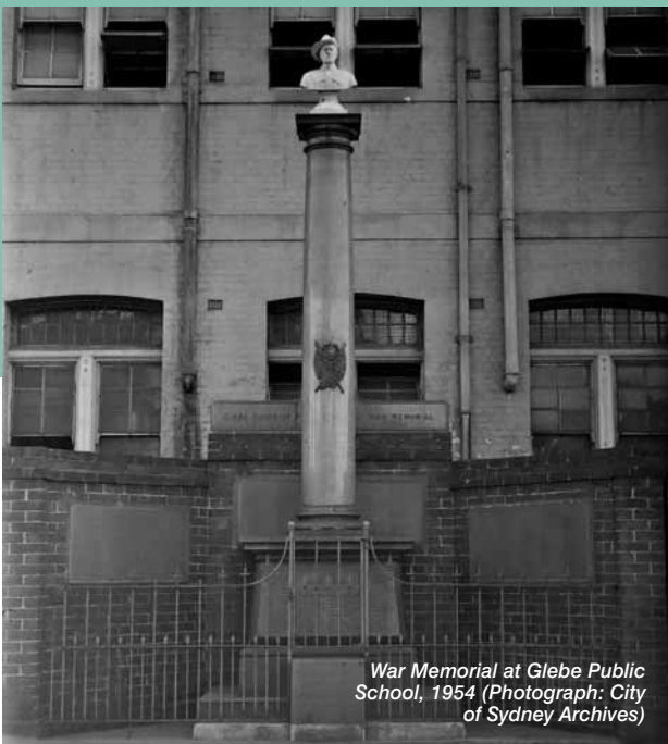
War Memorial at Glebe Public School, 1954

Glebe Public School opened in 1858. The oldest building on the site dates from 1862. This war memorial lists ex-students who served in World War I, with the dead on the black tablet in front. A bust of a digger rests on top of a column. Today, Glebe Public School hosts Glebe Markets each weekend.