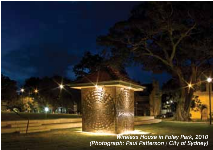
Wireless House in Foley Park, 2010

Continue down Bridge Road to the Reuss Houses and The Abbey (09), 154–160 Bridge Road.