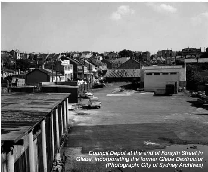
Council Depot at the end of Forsyth Street in Glebe, incorporating the former Glebe Destructor

Continue along the foreshore walk to the Burley Griffin Incinerator (19) at the rear of the park near Forsyth Street.