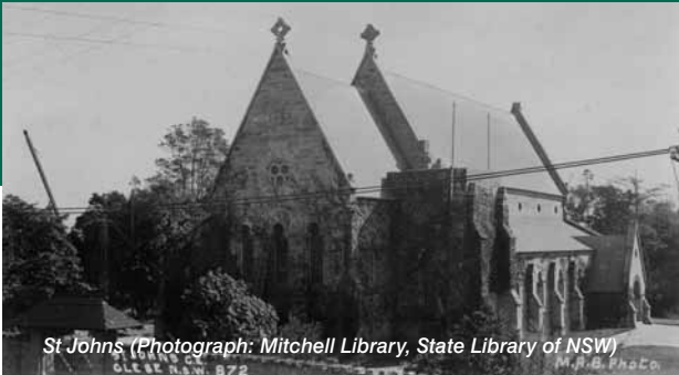
St Johns