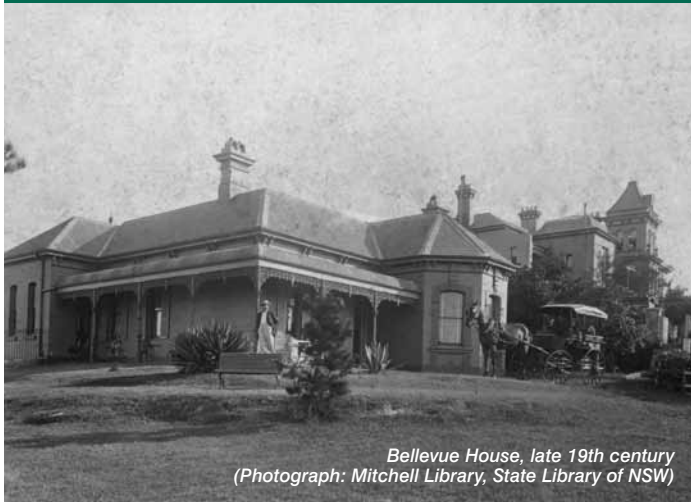
Bellevue House, late 19th century

Built in 1883, the house was designed by Ambrose Thornley Junior, who was responsible for many houses and shops around Glebe. Overlooking Blackwattle Bay, it was one of many mansions around Glebe Point. They gradually disappeared as industry took over the area in the 20th century. The growth of industry in Glebe, especially along the foreshores, had been encouraged by the development of wharfage in Rozelle and Blackwattle Bays. By 1945 there were 158 factories in Glebe, and they employed 4,496 workers. Bellevue has now been restored for community use and houses the Blackwattle Cafe.