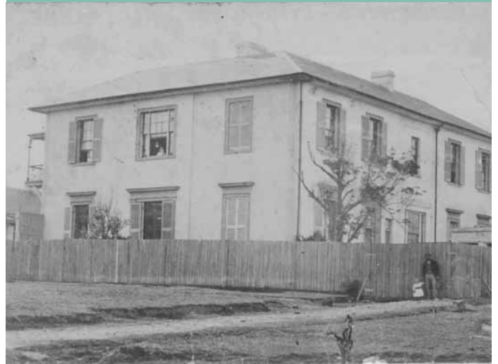
Lyndhurst, c1880