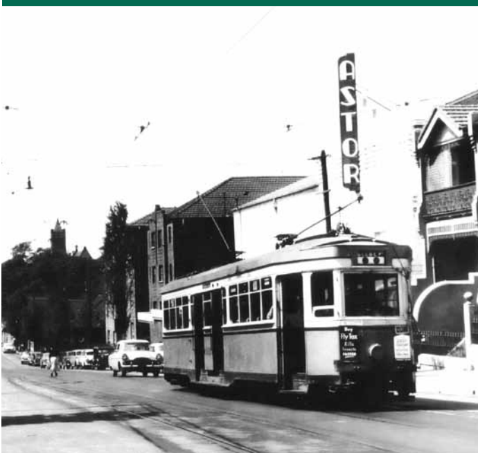
Valhalla, formerly The Astor, 1950s

The Art Deco cinema's original name, the Astor, can be seen on the Hereford Street elevation. In the 1970s, as the New Arts Cinema, it hosted live shows, including the first Australian production of The Rocky Horror Show . It later became a cinema again known as the Valhalla, specialising in independent films and revival showings of classics. In the 80s and 90s its 6-month program calendar seemed to be on every Sydney student share house wall. In 2008 the cinema was converted into offices.