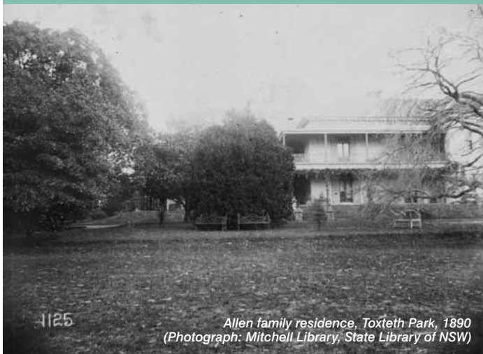
Allen family residence, Toxteth Park, 1890