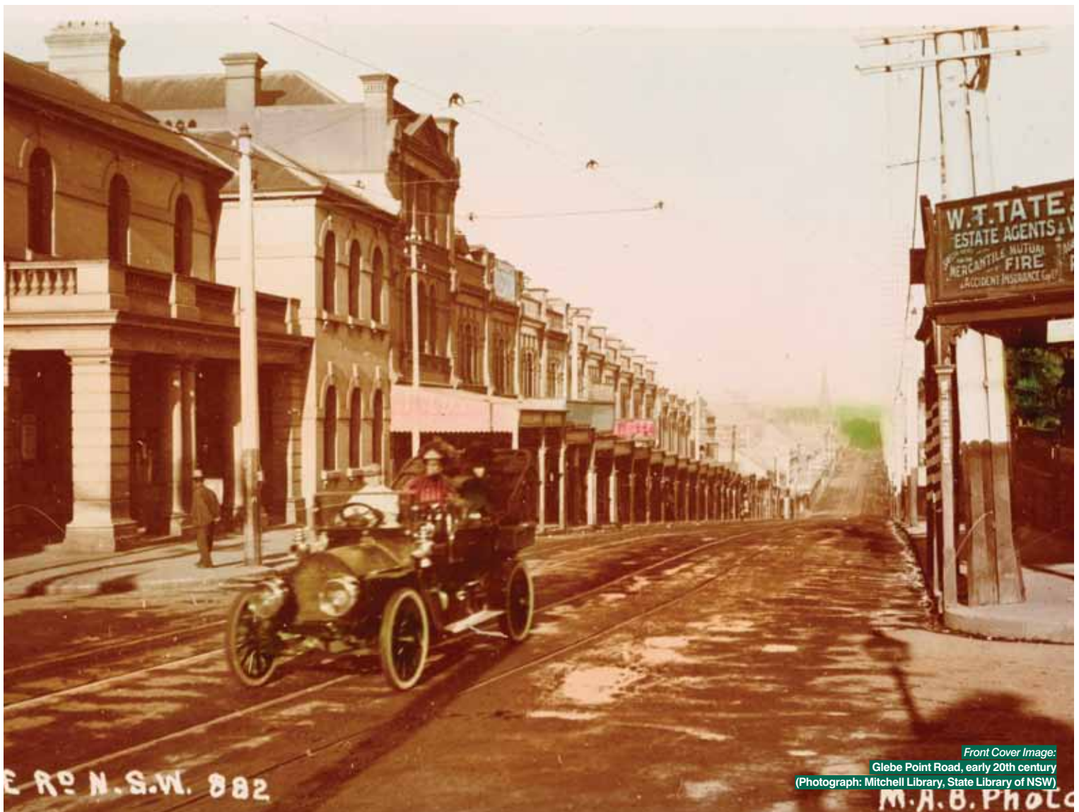
Front Cover Image: Glebe Point Road, early 20th century